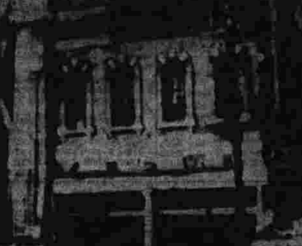
This hospital at Oshita, on Hokkaido Island, northern Japan, shows heavy damage caused by a 10-minute earthquake. It was so badly damaged it could not be used to shelter quake casualties. This picture was transmitted by land line from the scene to Tokyo and then radioed to San Francisco.

Heavy Damage Caused by 10-Minute Earthquake